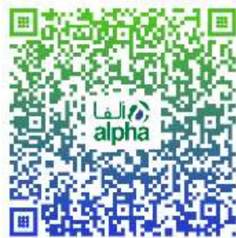
Final Bill Form

In the instance the documents are incomplete or fails the vetting the applicant will receive an email asking for the same. All applications if not completed with in 72 hours will be nulled.